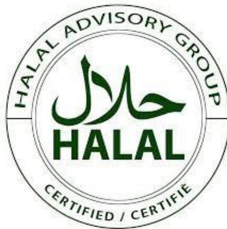
Figure 2. Halal food certificate logo used in the U.S. by the Halal Advisory Group issued as an accreditation to restaurants, halal meat butcher markets, and other halal food products. Reprinted from the Halal Advisory Group from https://www.halaladvisory.ca/ (2014).

halal food products. Reprinted from the Islamic Food and Nutrition Council of America from http://www.ifanca.org/Pages/index.aspx (2015).