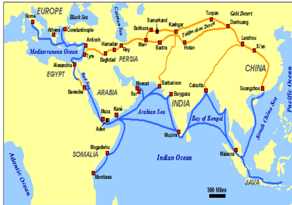
Figure 5. The Ancient Silk Road map showing the overland and maritime trade routes that China is revitalizing into a modern version to export halal products. The overland routes are depicted in orange lines, whereas the maritime routes depicted in blue lines.