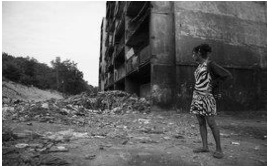
Figure 2. Roma Gheto in Region Ústí