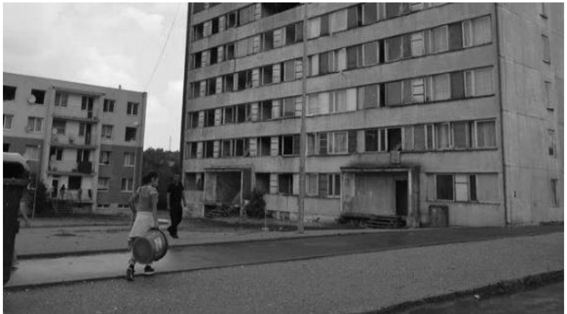
Figure 4. Roma Ghetto in Region Litvinov