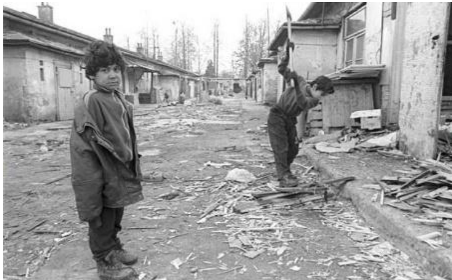
Figure 3. Roma Ghetto in Region Ústí