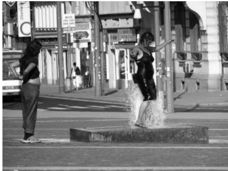
Figure 9. Roma woman in Region Ústí during the summer time