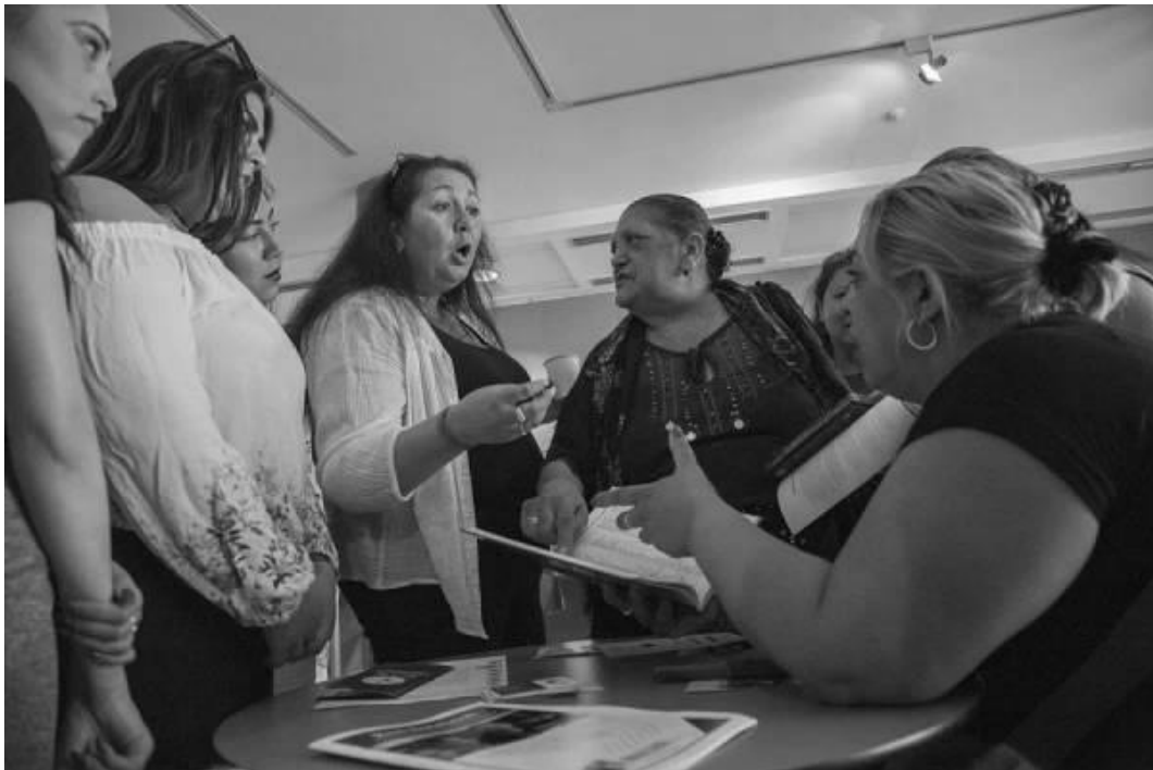
Figure 6. Discussion of Roma women's (Roma Ethnic Meeting on Women Discrimination)