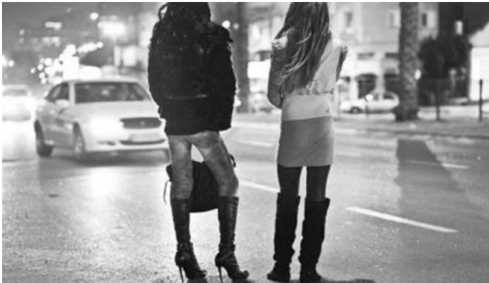
Figure 8. Prostitution