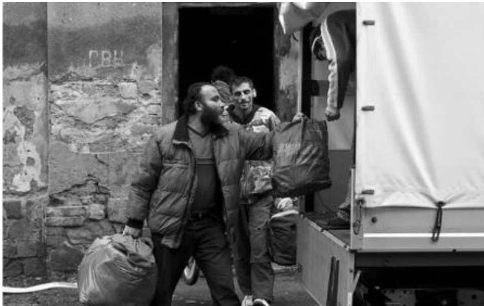
Figure 5. Migration of Roma populations' (From Slovak to Czech Republic)