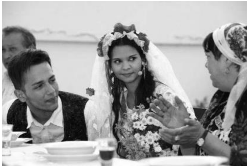
Figure 7. Young Roma bride