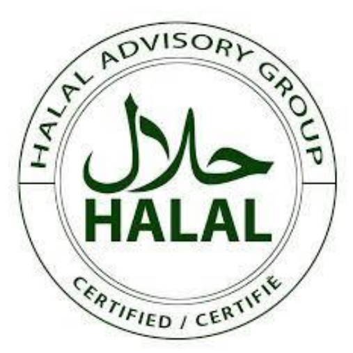
Figure 2. Halal food certificate logo used in the U.S. by the Halal Advisory Group issued as an accreditation to restaurants, halal meat butcher markets, and other halal food products.

halal food products.